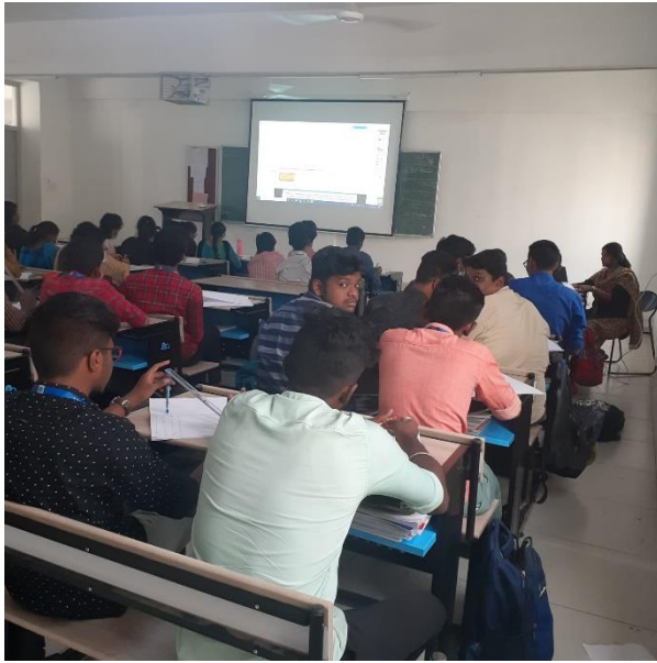
Learning through ActivInspire