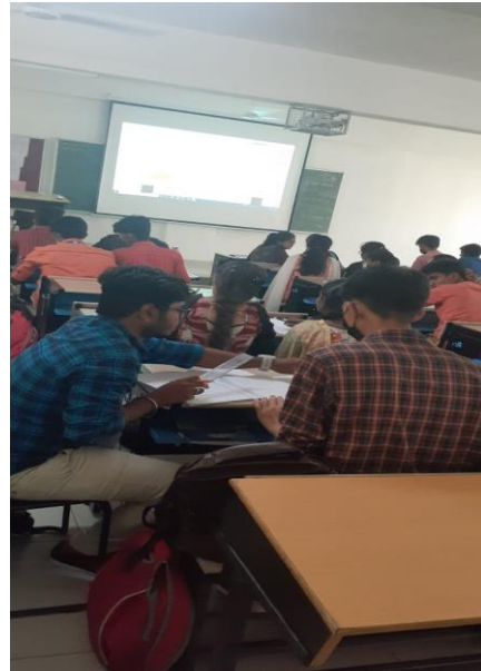
Learning through ActivInspire