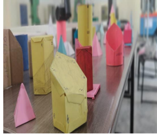
Learning through Model making