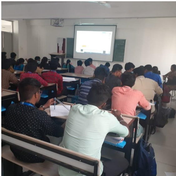
Learning through ActivInspire

Topic: Projection of Solids, Section of Solids & Development of Surfaces