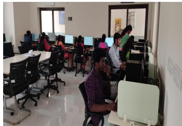
Learning through Auto CADD