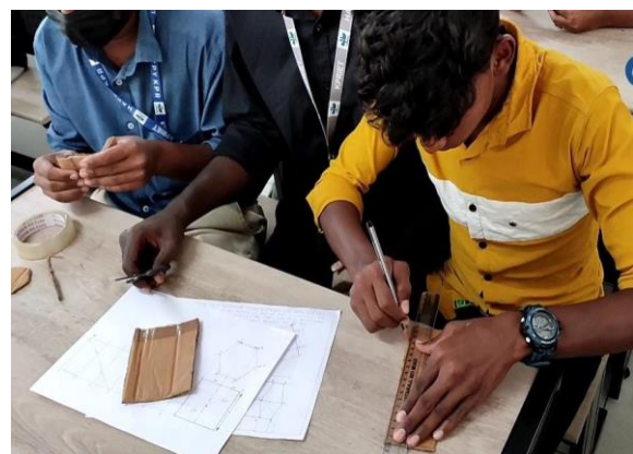
Learning through Model making