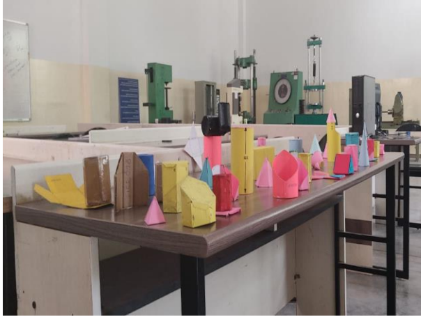
Learning through Model making