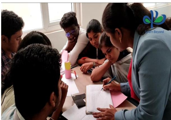
Learning through Model making